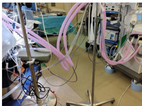
Figure 5: Example of a long breathing system being suspended to prevent trailing on floor