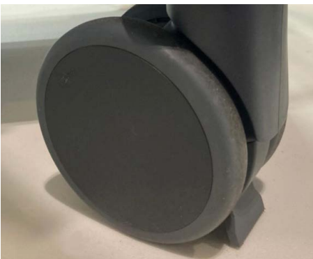
Figure 2: Wheel of Mindray A9 anaesthesia workstation, showing cable deflector on leading edge