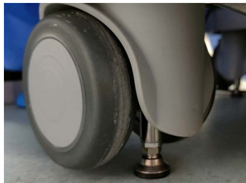
Figure 3: Wheel shroud on an operating table, showing incomplete deflection protection (metal post is deployed table brake, which retracts when table is to be moved)