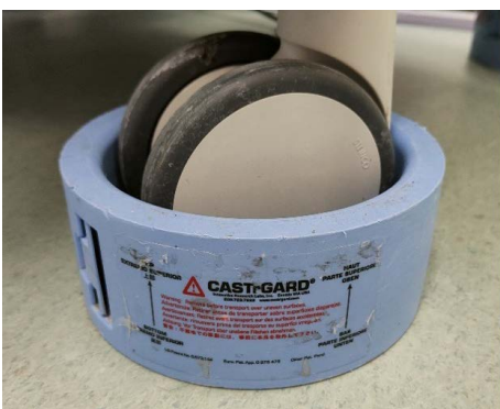
Figure 4: CASTrGARD in use