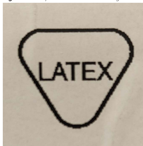
Figure 1: ISO symbol for items containing latex